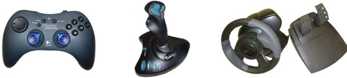
Figure 1: Different input devices supported by the exploration system: Logitech's WingMan Cordless Rumblepad (left), Primax' Raptor 3D joystick (center), and Microsoft's SideWinder force-feedback steering wheel with race car pedals (right).