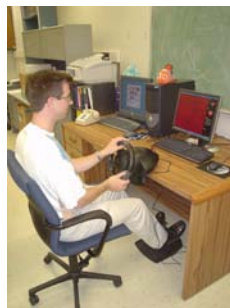
Figure 3: A user in front of the visualization system using Microsoft's SideWinder Force-feedback wheel.