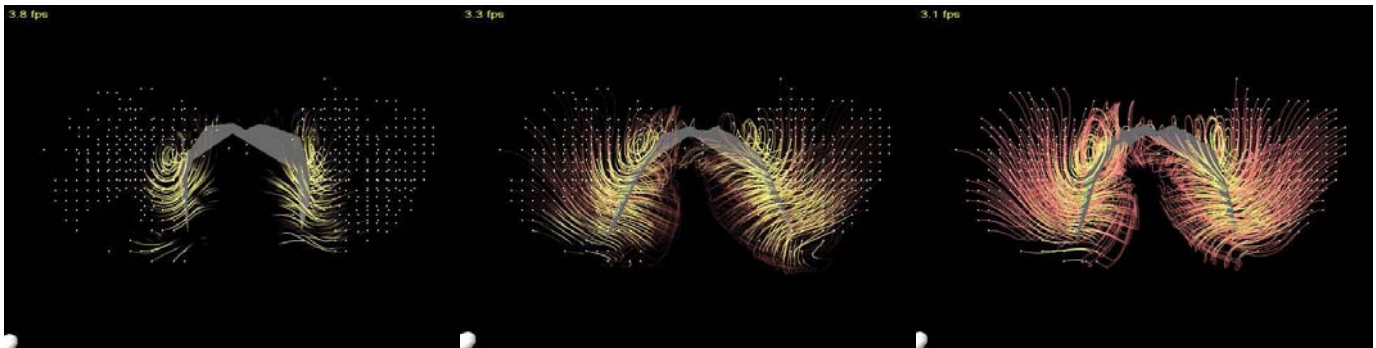
Figure 2 Streamlines seeded at low \lambda_2 regions. (a), (b), (c) show variations of the mapping of transparency to \lambda_2 . White dots represent the seeds of streamlines. Yellow color maps to low \lambda_2 values.