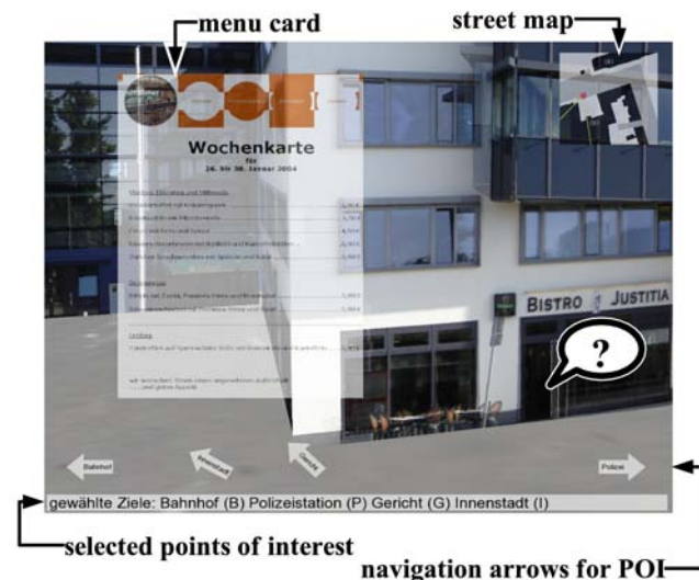
Figure 2: Example: Acquisition of information about "Bistro Justitia"

Some parts of the city of Kaiserslautern are supposed to be integrated in the 3D model. The digital reconstruction of every building can be compared to the manufacturing of a new car. The product lifecycle management (PLM) system creates every reconstruction. A multimedia system based on 3D geometry will be developed in conjunction with additional information like video, text or audio. (Figure 2)